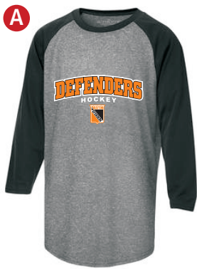
3/4 SLEEVE TEE ADULT $25.00 YOUTH $25.00