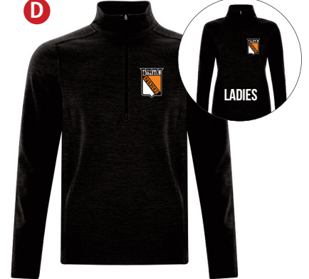
DYNAMIC 1/4 ZIP FLEECE MEN $45.00 LADIES $45.00