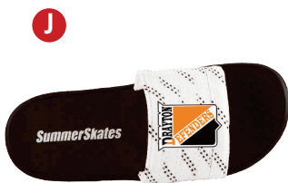
SUMMER SKATE ADULT $30.00 YOUTH $30.00