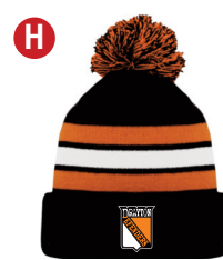
POM POM TOQUE ONE SIZE $30.00