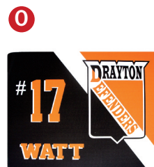
SKATE MAT ONE SIZE (20" X 15") $20.00