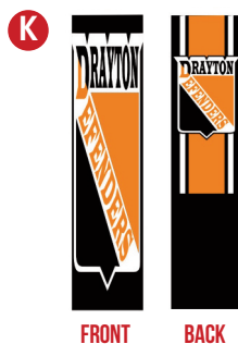
ATHLETIC SOCKS SIZES XS S M L $23.00