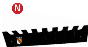
CUSTOMIZED STICK RACK NAME, # & TEAM LOGO $20.00