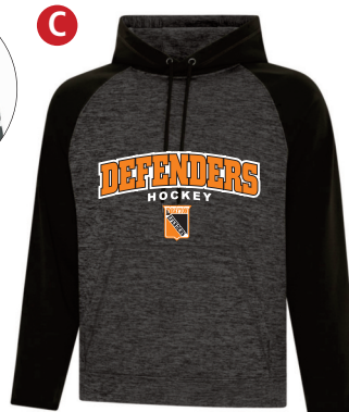
TWO TONE HOODIE ADULT $45.00 YOUTH $45.00