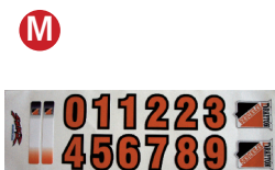
PLAYER STICKER SHEET $12.00