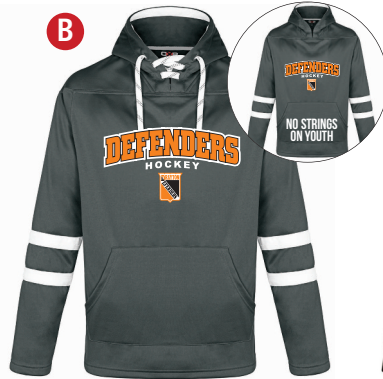
SUBLIMATED HOODIE ADULT $60.00 YOUTH $60.00