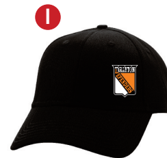
ADJUSTABLE CAP ADULT $20.00 YOUTH $20.00