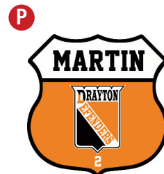
PERSONALIZED HIGHWAY SIGN ONE SIZE (6" X 12") $25.00