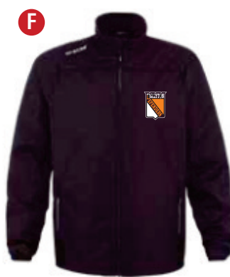
CCM MIDWEIGHT JACKET ADULT $90.00 YOUTH $85.00