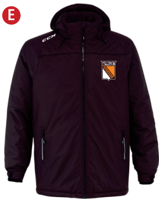
CCM PARKA JACKET ADULT $125.00 YOUTH $120.00