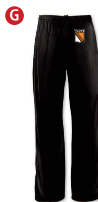
WARM UP PANTS ADULT $40.00 YOUTH $39.00